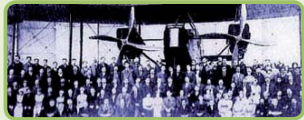
Aircraft Hangar

of the flat-racing season. The racecourse was closed in 1964.