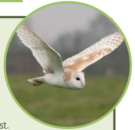
Barn owl (Matthew Harrison)

With over 40 horses grazing on the common, the rougher grasses are kept under control, allowing more birds to nest.