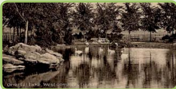
Ornamental pond for 1907 Royal Show (Maurice Hodson collection)

West Common contains archaeological remains from at least as early as the Roman period, and has both been exploited for building materials and used for agriculture. Much of the lower ground, to the south-west of the old Turnpike Road running to Saxilby, was a source of sand and gravel at various times. It was also useful as grazing land - held in 'common', and local people had 'common rights' to use the land for grazing and farming.