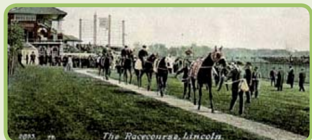
The racecourse 1905

The Lincolnshire Show was held at West Common regularly from 1876, and in the last week of June 1907, the Royal Show was held here. Among the guests was the King, for whom a special pavilion was created, while the pond was decorated for the occasion. The main pavilion lay opposite Alderman's Walk (point ③ on the map). The Common also hosted the Show of 1947.